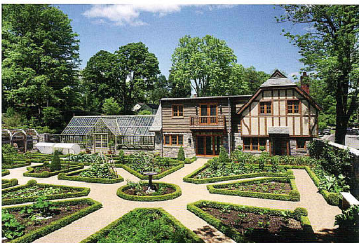
Levine After elevation