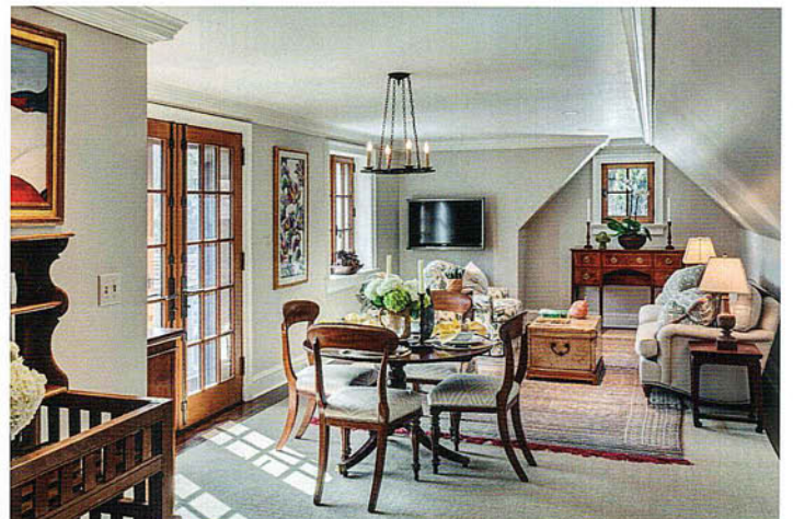
Levine gardener's cottage family room