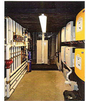
Levine co-generation system

The wine cellar, sheathed in antique barn siding with antique beams and oak storage racks, won Outstanding Special Purpose Room , (see photos on opposite page). and two 10 K Yammar gas generators produce power 24/7, and sell excess power back to CL&P.