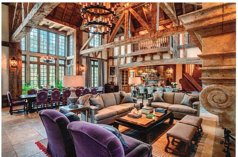
Levine Great Room

A magnificent granite tower, which won Best Exterior Home Feature , is home to a stunning master bedroom with spiral stair leading to an exquisite pyramid ceiling tower room office that won Best Interior Feature . See photos on opposite page.