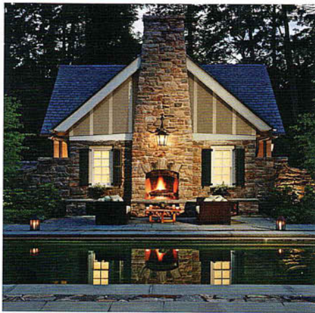
Significant outdoor Fireplace

The amazing OUTDOOR LIVING ENVIRONMENT of this home features a pool, terrace, dining porch and charming stone faced fireplace on the garage wall, which won BEST OUTDOOR FEATURE .