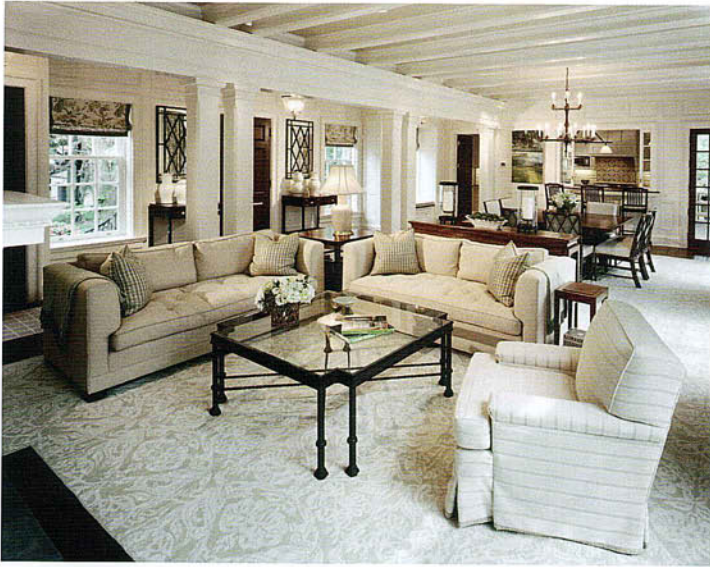
Significant entertainment room