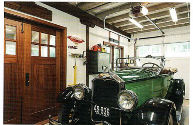
Celebration antique car garage workshop

Bill Freeman, Celebration Contracting, built this 1,200 sf one bedroom Post & Beam BEST NOT SO BIG HOME in Old Saybrook with a SIPS roof and beamed pine family room.