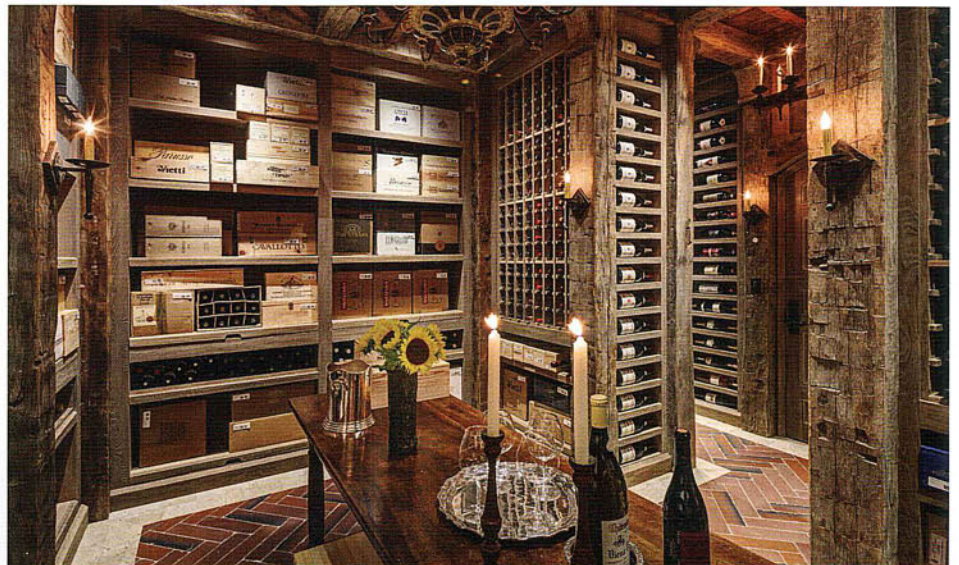
Levine wine cellar