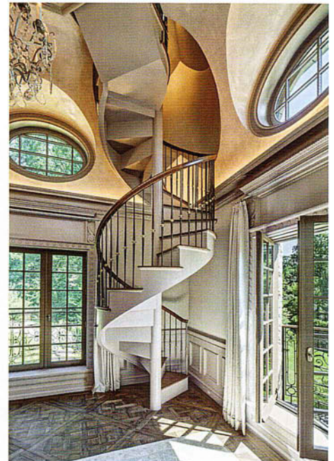
Levine MBR Spiral Stair (detail shot)