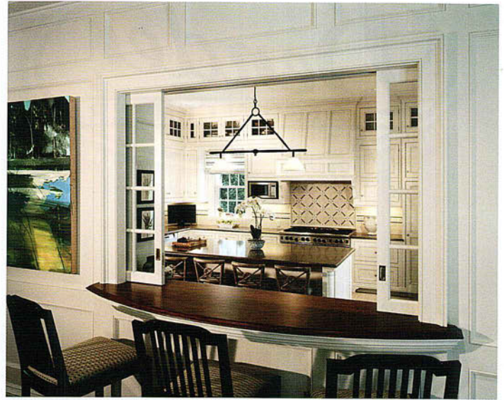
Significant bar stool counter

BEST OUT OF STATE HOME went to Significant Homes for a superbly designed and built stucco home in Bronxville by builder Whitney Mathews and architect Charles Hilton. Outstanding features include an exquisite entertainment room with bar stool counter and glass pocket doors to the kitchen; a master bath with paneled tub niche and a stunning children's dormitory room.