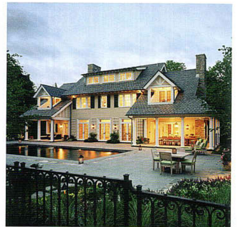
Significant rear elevation