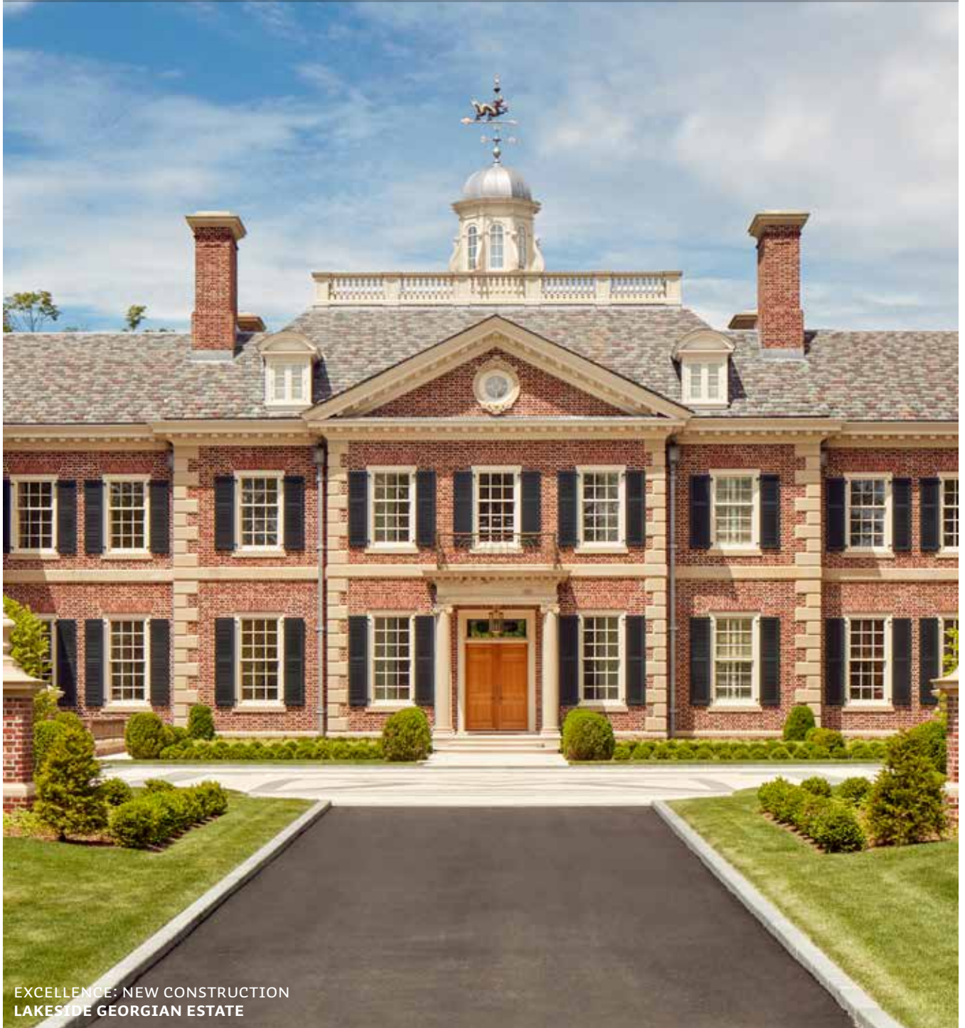
EXCELLENCE: NEW CONSTRUCTION LAKESIDE GEORGIAN ESTATE