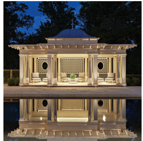
above: A poolside pergola designed by Hilton is an elegant escape.

Whether overlooking Long Island Sound, situated alongside a picturesque lake, nestled in the verdant countryside or positioned steps from the bustling heart of downtown, Hilton’s projects all feature custom details that evoke a sense of place. He works in traditional vocabularies with a focus on exquisite classical detailing, but his houses are also completely