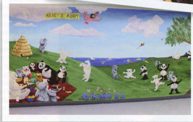
Top: Liz and Nina celebrating with the kids at Family Centers Bottom: The mural that encourages kids to explore

While the muralists are open to commissions, "we've just been happy to brighten up